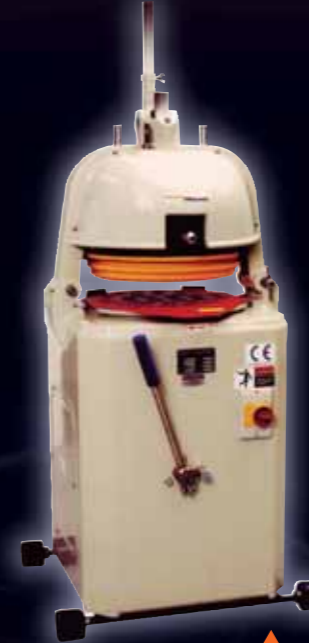
Bun Divider Rounder

Spiral Mixers BT280 - 50Kg Capacity 50Kg Flour 2 Speeds & Reverse Main Motor 6 3/4 HP 415V 3PH