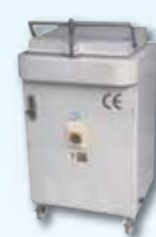
20 Piece Hydraulic Dough Divider