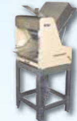
Bench Model Slicer 12, 14, 15, 17, 24mm available