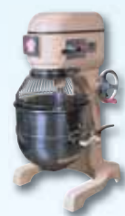
Planetary Cake Mixer Available in 20, 40 & 60 Litres