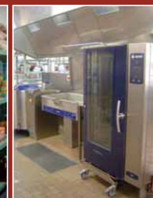
Houno Roll-in Combi Oven