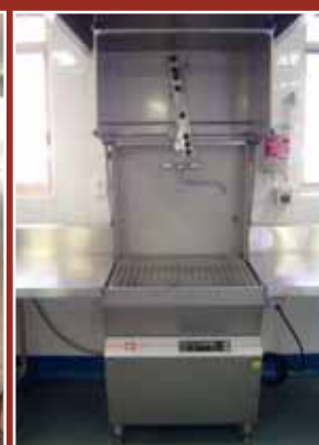
Jeros Pot Washer