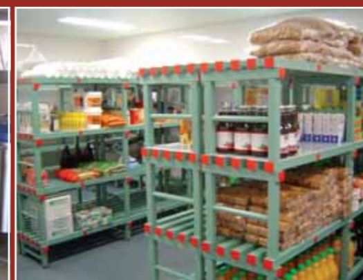
REAHygienic Storage Shelving