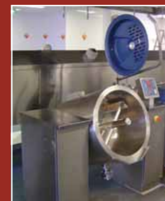
Joni Mixer Kettles

QUALITY PRODUCTS AND PROFESSIONAL ADVICE FROM THE EXPERTS