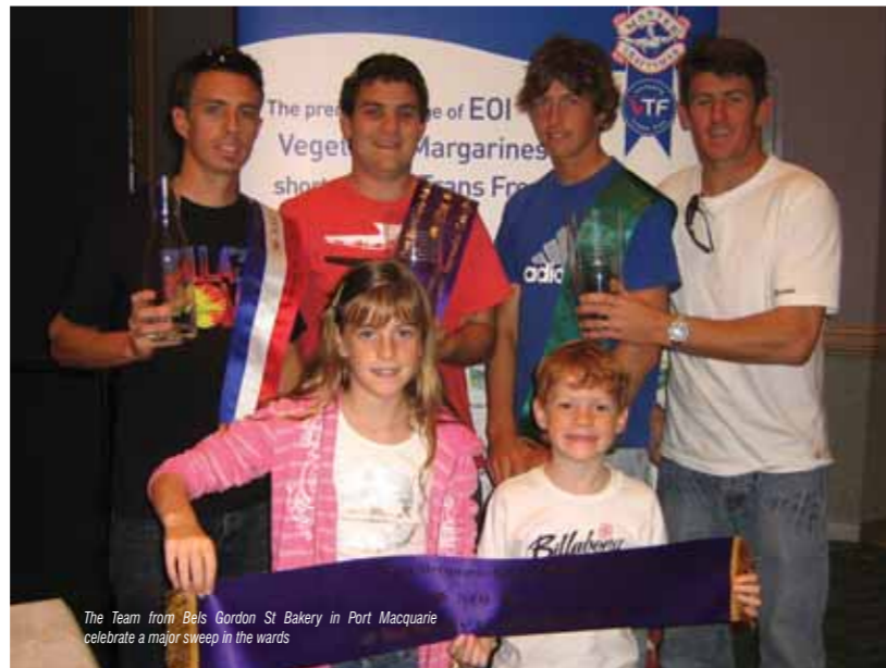
The Team from Bels Gordon St Bakery in Port Macquarie celebrate a major sweep in the awards

The encouragement award is offered at every baking show.